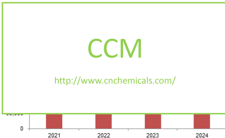
Figure 4-1 Forecast on output of UFM in China, 2021–2024, tonne